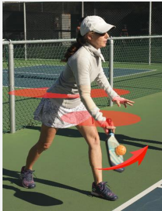
Figure 4-3 (legal serve)

(Photos and graphics courtesy of Steve Taylor, Digital Spatula)