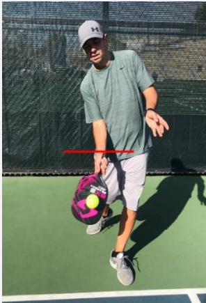
Figure 4-1 (legal serve)